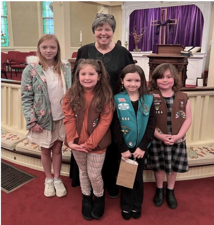
Girl Scouts from the Troop Landrum United Methodist Hosts attend the service on Girl Scout Sunday March 12.