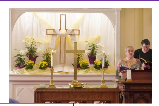
Easter Service 2024