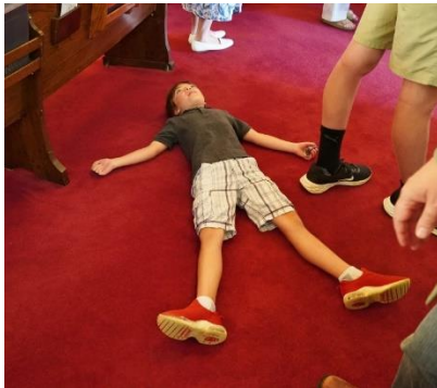
Wow what a sermon!