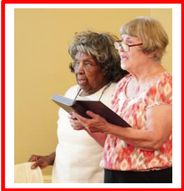
Sundays in June