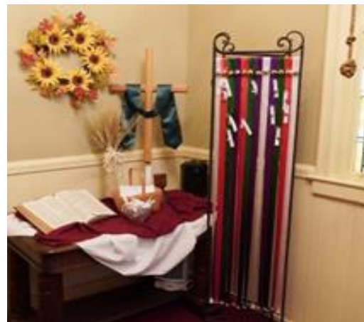
LUMC All Saints Remembrance banner