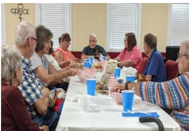
Silver Spirits reminiscing at Lunch with comfort foods and memories.