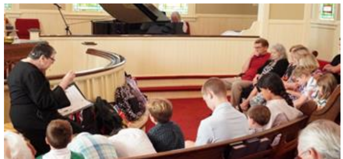
Blessing of the backpacks, students, and teachers